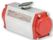
Extreme High Temperature Actuator