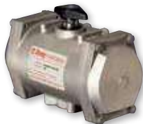
Stainless Steel Actuator